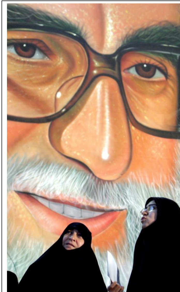
Oversight: Iranian women casting ballots, Tehran, June 17, 2005.

enemies and plotters of these insane displays want, and the Koran instructs us to take the opposite position.”