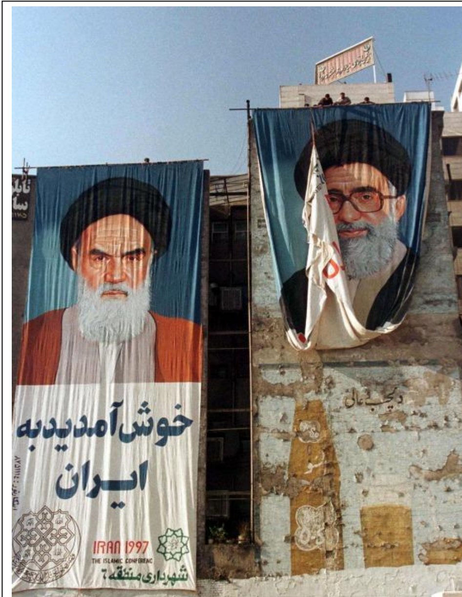
Teacher and student: portraits of Iran's supreme leaders, Tehran, November 1997.

"The history of our nation is in a black, bitter, and bloody chapter, mixed with varieties of hostility and spite from the American regime. [That regime] is culpable in 25 years of support of the Pahlavi dictatorship, with all the crimes it committed against our people. The looting of this nation's wealth with the shah's help, the intense confrontation with the revolution during the last months of the shah's regime, its encouragement in crushing the demonstrations of millions of people, its sabotage of the revolution through various